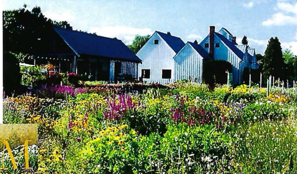
The Garden Market offers a variety of plants, flowers, herbs, and more.

Hamptons garden—with my own fresh approach, of course.