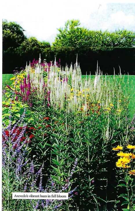
Azevedo's vibrant hues in full bloom