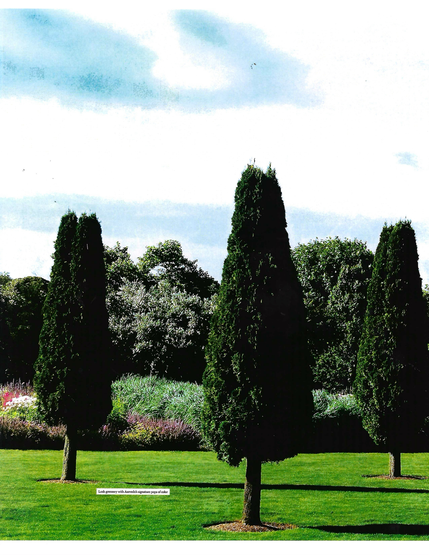
Lush greenery with Azevedo's signature pops of color