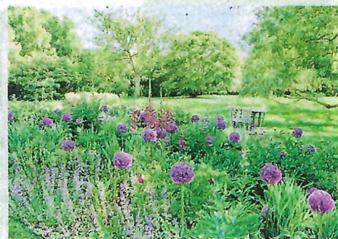
A HARMONIOUS BLEND OF NATURAL ELEMENTS