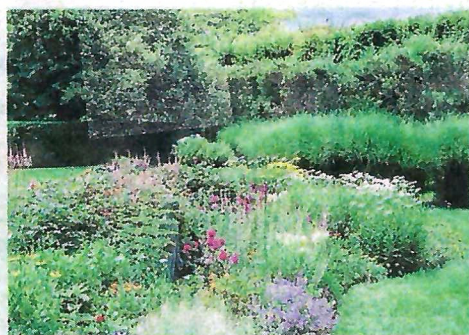
METICULOUSLY ARRANGED GREENERY

The feel of a landscape goes beyond color. Plants also provide texture, giving a sculptural, three-dimensional aspect very different from painting on canvas.