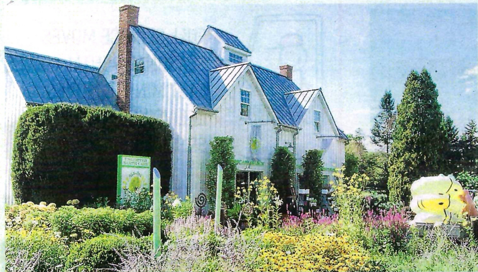
CAREFULLY SELECTED PLANTS EXEMPLIFY THE EXPERT CRAFTSMANSHIP OF UNLIMITED EARTH CARE.