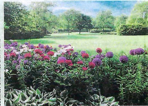
ENHANCED RESIDENTIAL GARDENS

“My approach is to have varied textures and heights to create interest through wind and change,” he says.