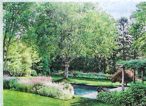
AN ELEGANT BACKYARD TRANSFORMATION